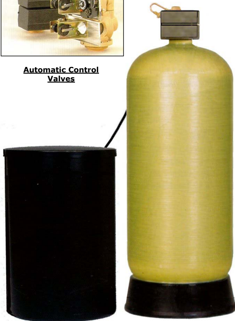
IF-750AL-3-3900 Automatic Dealkalizer